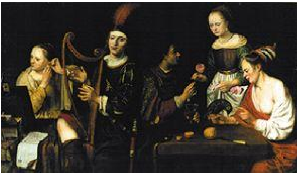
“Allegory of the Five Senses” 1651

The Staatliches Museum, Schwerin, Germany, has in its collection a painting by Hermanus van Aldewerelt called “Allegory of the Five Senses” painted in 1651.