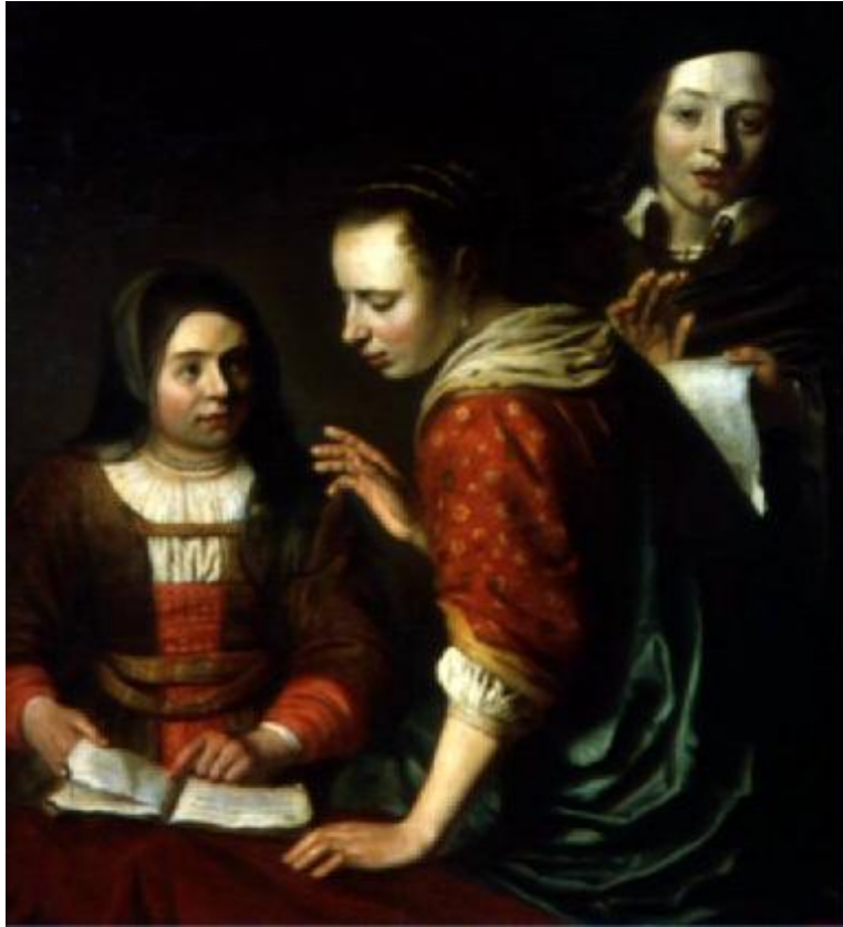
“Musical Party” 1652

The Staatliches Museum, Schwerin, Germany, has in its collection a painting by Hermanus van Aldewerelt called “Allegory of the Five Senses” painted in 1651.