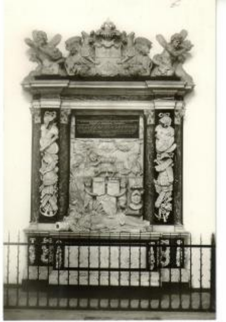
Admiraal Maerten Harpertz Tromp Monument

The Tromp and van Kinschot families also played major roles in Delft. An outline of the Tromp, van Kinschot, de Roo and van Alderwerelt connection is shown on page 5.