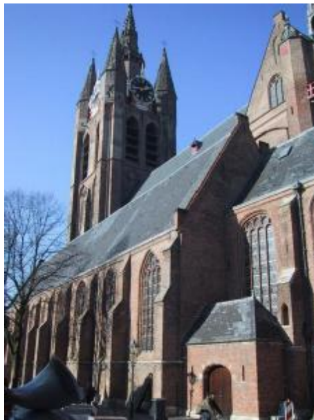
Oude Kerk (Old Church) Delft